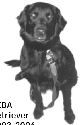
REBA Retriever 1993-2006

The board meets 5 times a year; its next meeting will be in September. The September meeting and future meetings will be in the Community Room of the Oswego Bank in the Village Shopping Center , Lake Oswego.