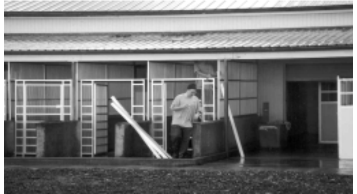
POOCH YOUTHS also learned useful building skills as they renovated and improved the 12-year-old Vollum Dog Kennels.

Thanks to grants from the JUAN YOUNG TRUST and the KAREN M. SCHROTH FOUND-